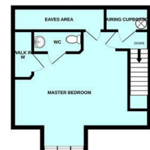
Made with Mergys ©2026